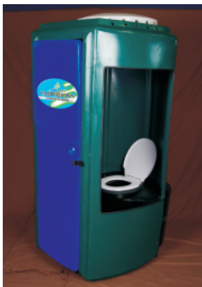
A Camperdown portable toilet with a basin